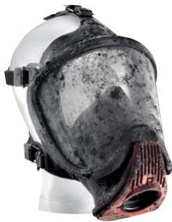
Respirator mask contaminated