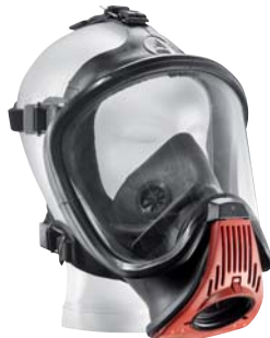
Respirator mask cleaned in an ultrasonic bath

Used respirators can be contaminated with pathogenic germs or with dangerous substances. In order to restore operability and to avoid sanitary risks, respirators are to be cleaned and disinfected according to valid rules after every use.